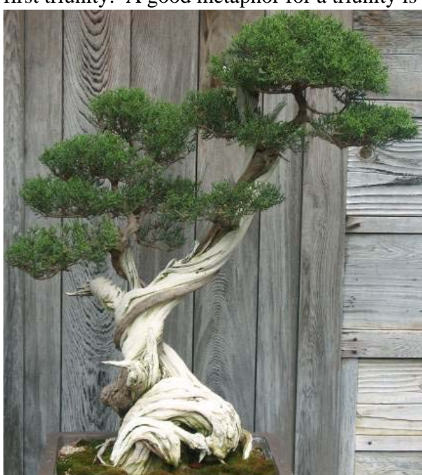
Figure 1: The Existential Trinity is the "organic" trunk; the first triunity is an "associative aggregate" shown by the weaving of the branches.

The existential trinity (the Paradise Trinity) consists of the Universal Father, the Eternal Son, and the Infinite Spirit. We are told in somewhat metaphorical terms that it is "corporative." It is undivided and indivisible Deity; it is organic (1147:7; 104:3.8). Yet the same three existential Deities, as persons, functionally associate in a group called the first triunity. A good metaphor for a triunity is three people pulling on a rope in a tug-of-