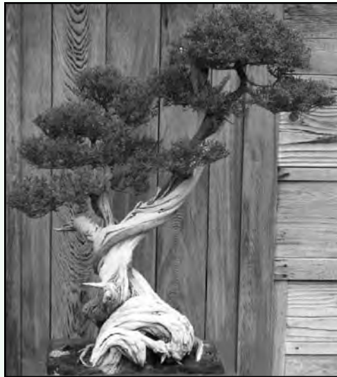
Figure 1: The Existential Trinity is the “organic” trunk; the first triunity is an “associative aggregate” shown by the weaving of the branches.

According to a Divine Counselor, there has been much confusion because of the previous failure “to distinguish between the personalities of the Paradise Trinity and between Paradise