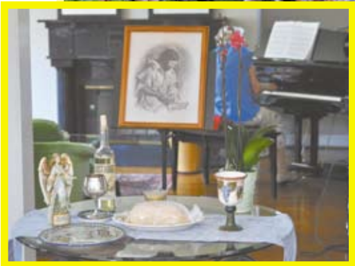
Grand Canyon Society