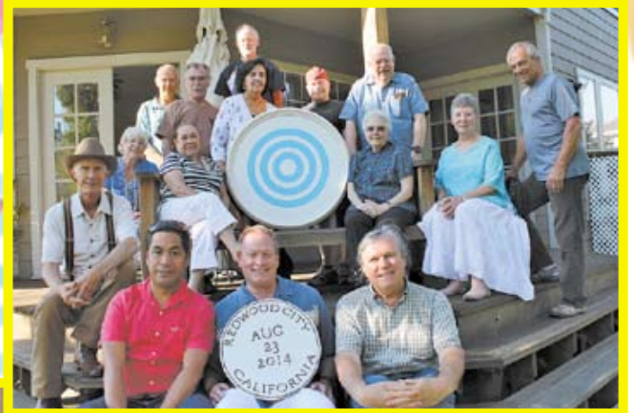
Golden Gate Circle