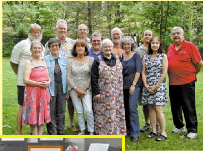
Orvonton Society, Bloomington, Ind.