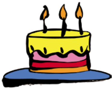
Rocky Mountain Spiritual Fellowship