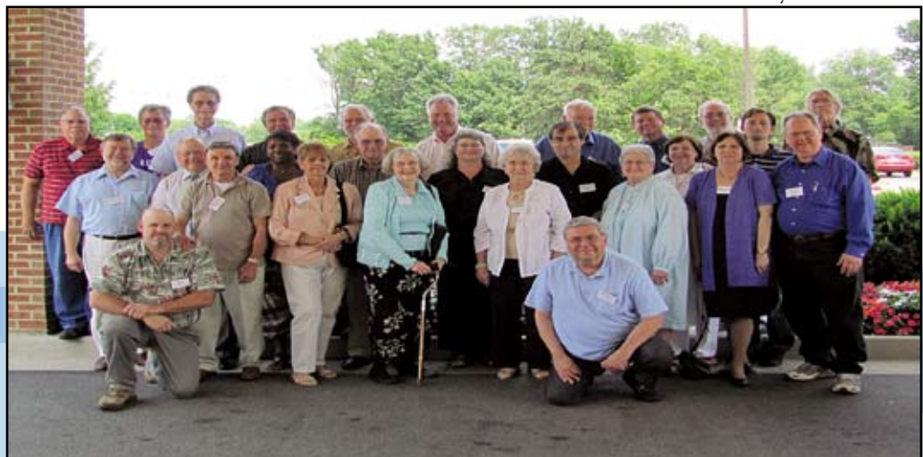
Orvonton Society and Friends