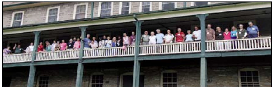
Heart of the Mountains