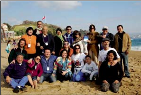
Study Group from Chile