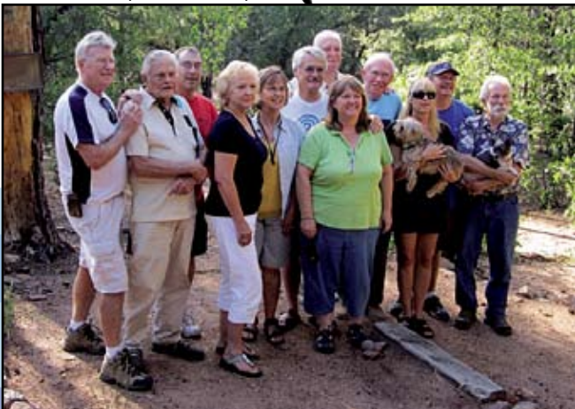
Grand Canyon Society