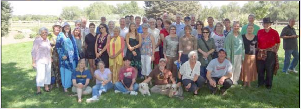
Rocky Mt. Spiritual Fellowship