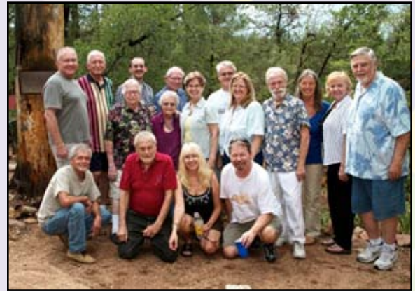
Grand Canyon Society