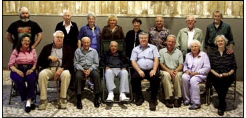
First Society (Chicago) and the Greater Lake Michigan Urantia Association