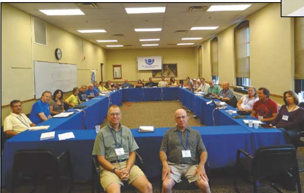
The Fellowship Triennial Delegate Assembly meets at SSS 12 to elect new General Councilors.