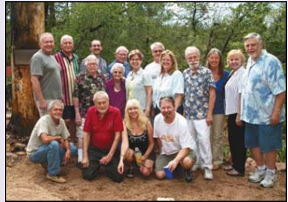
Grand Canyon Society