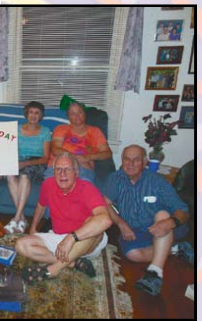
Pueblo, CO Urantia Book Study Group