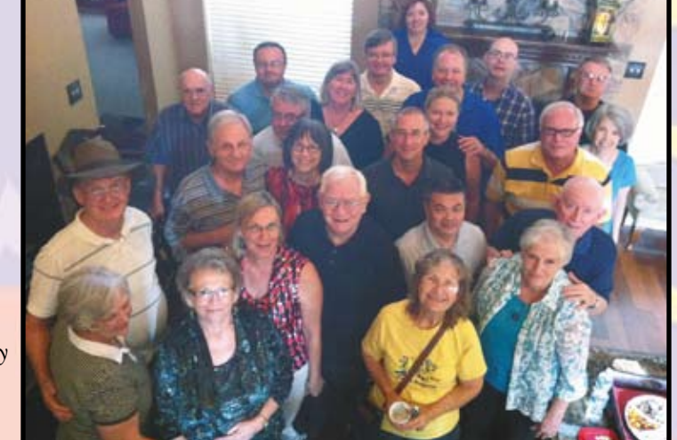
North Texas Society