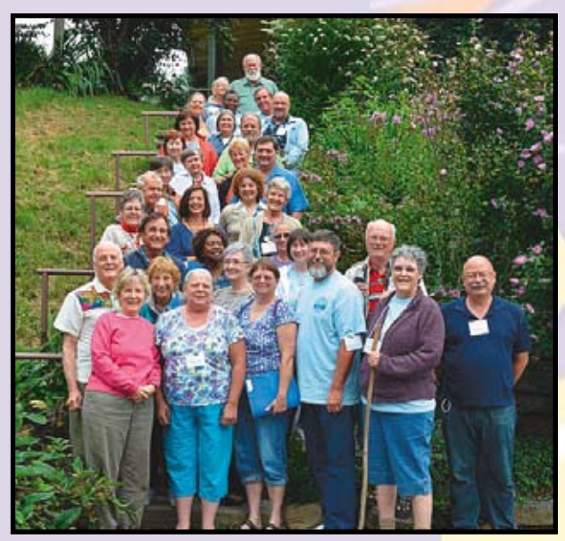
Heart of Mountains Retreat in North Carolina