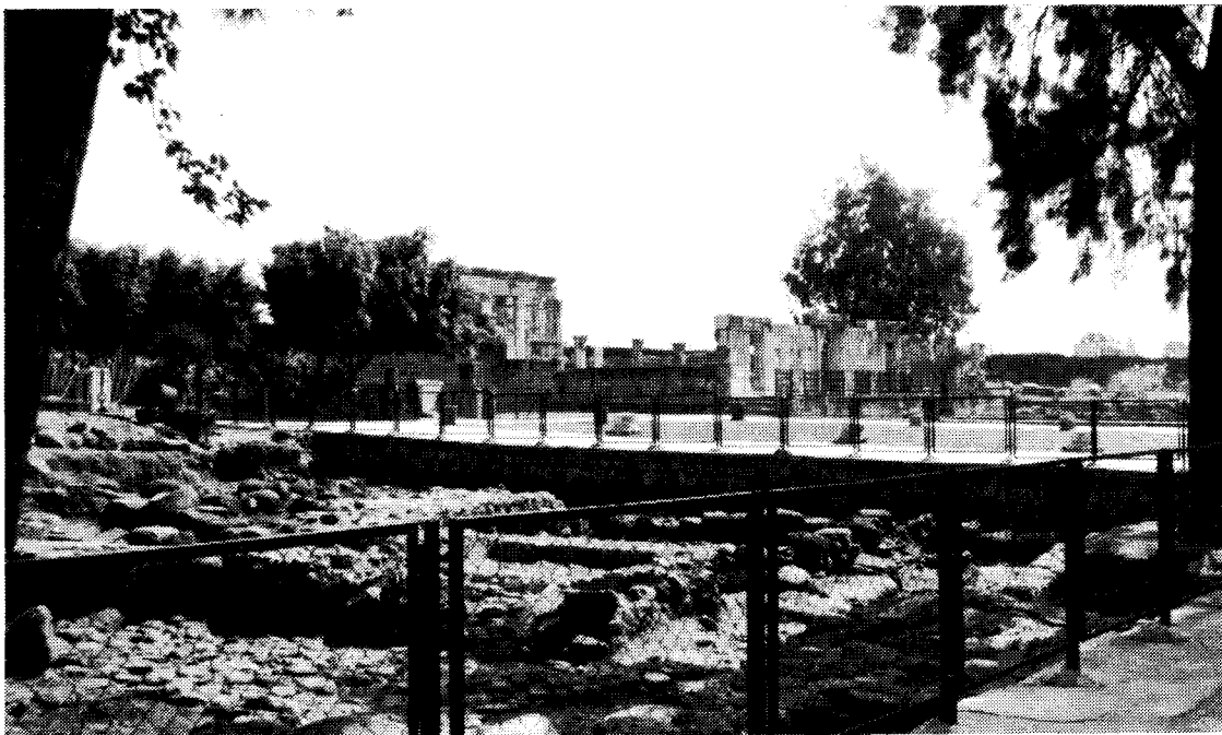
Present day ruins of Capernaum, looking north-east toward the partially reconstructed synagogue.

There are also many references to the city of Sepphoris. Jesus frequently visited there as a child, and as a adult spent several months working there as a smith. Sepphoris was also the place where Joseph met a tragic death. When Jesus was but fourteen, Joseph was a foreman on the construction of the governor's residence and was critically injured by a falling derrick.